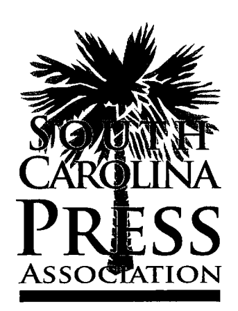
Exhibit No. 17 Public Hearing Notices Page 24 of 61

P.O. BOX 11429 Columbia, SC 29211 Telephone: (803) 750-9561 Fax: (803) 551-0903 WWW.SCPRESS.ORG